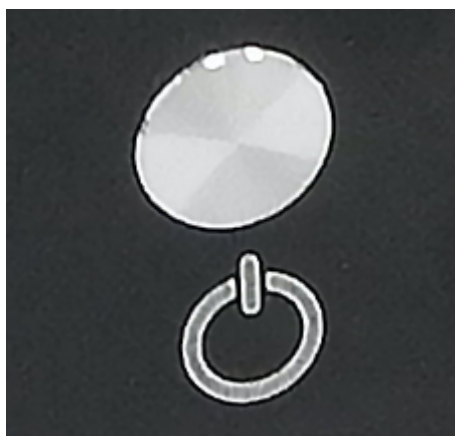
Figure 911: Figure 1a: Power Button

The POWER button ( Figure 1a ) is located to the opposite side of the power input connector and can be used to switch the power ON or OFF.