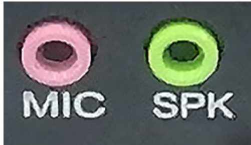
Figure 918: Figure 6: Audio In and Audio Out Connectors

The product features audio in and audio out connectors as shown in the Figure 6 below.