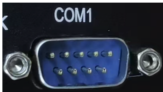
Figure 912: Figure 2: D-Sub (RS232) COM1

Product has 2 x 9-pin D-Sub connectors which are configured as RS232 interfaces by default. The two connectors are on two different sides: COM1 ( Figure 2 ) and COM2 ( Figure 2a ).