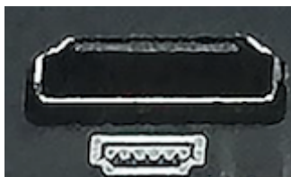
Figure 916: Figure 5: HDMI Connector

Although not equipped with the screen on its own, the CS86-BOX-J1900 features 1 x HDMI connector ( Figure 5 ) and 1 x VGA connector ( Figure 5a ). The two connectors allow connecting two external monitors in synchronous or asynchronous modes. HDMI and VGA output resolution can be configured by the software or the OS, up to 1920 x 1080 at 60Hz.