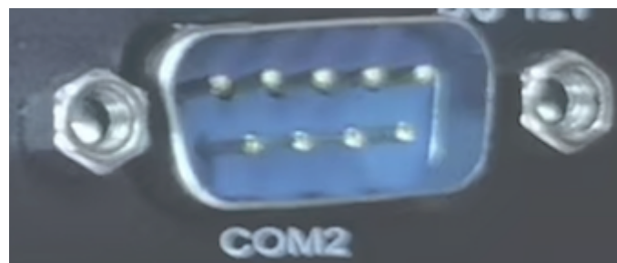
Figure 913: Figure 2a: D-Sub (RS232) COM2