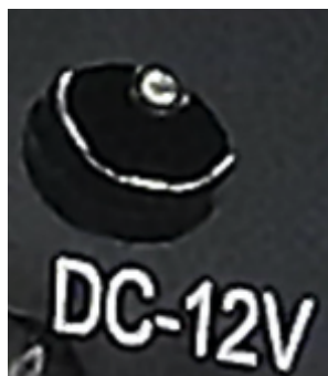
Figure 910: Figure 1: Power Input Section

The CS86-BOX-J1900 Industrial PC can be powered by 12V DC. The power input connector is a 5.5 x 2.5 mm DC connector ( Figure 1 ).