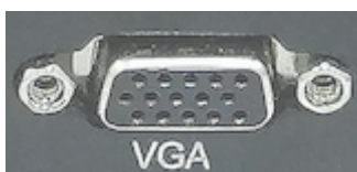
Figure 917: Figure 5a: VGA Connector