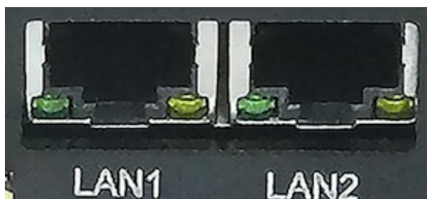
Figure 915: Figure 4: 2 x RJ45 GbE LAN Connectors

2 x LAN (RJ45) connectors (Figure 4) provide Ethernet connectivity over standardized Ethernet cables. The integrated two-port Ethernet interface supports 10/100/1000BASE-T/TX specifications with automatic speed negotiation and Wake on LAN (WoL) functionality. Power over Ethernet (PoE) is not supported.