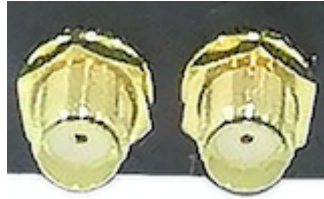
Figure 919: Figure 7 SMA Connectors for WiFi Antennas

The product includes two SMA connectors for external Wi-Fi antennas, as illustrated in the Figure 7 below.